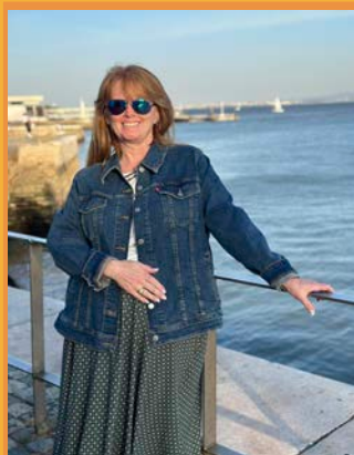
Enjoying the view in Lisbon.

Along with onboarding a new class occurred the graduation of class 15. This is always a bittersweet time for me. I am overjoyed at how far the fellows have grown in their leadership journey, but I am saddened that I no longer will be going on adventures with the same individuals I have spent the last 18 months with. I must admit to shedding a few tears during this graduation celebration, but I will always have a part of class 15 in my office to remind me of our adventures together. Bob the artichoke has settled into his new home, my office. He may accompany class 16 fellows on their leadership journey or perhaps a new mascot will appear?