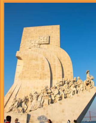
Padrão dos Descobrimentos -Discoveries Monument.