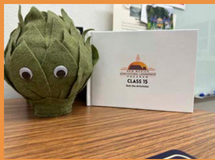
Bob the artichoke in his new home.