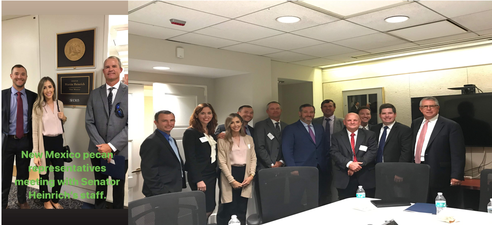
New Mexico pecan representatives meeting with Senator Heinrich's staff.