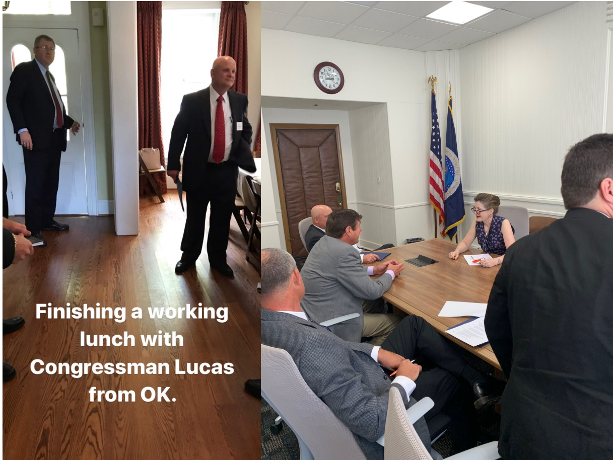
Finishing a working lunch with Congressman Lucas from OK.